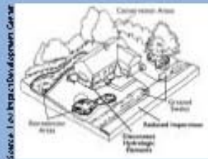
LID Low Level Source Controls

Water moving through these systems is slowed, filtered, and percolated into the ground. These systems are great as low-cost alternatives to curbs, gutters, and pipes.