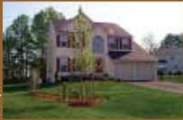
Residential Lot with Bioretention Somerset Development Prince George's County, MD

Ever wish you could simultaneously lower your site infrastructure costs, protect the environment, and increase your project's marketability? With LID techniques, you can. LID is an ecologically friendly approach to site development and storm water management that aims to mitigate development impacts to land, water, and air. The approach emphasizes the integration of site design and planning techniques that conserve the natural systems and hydrologic functions of a site.